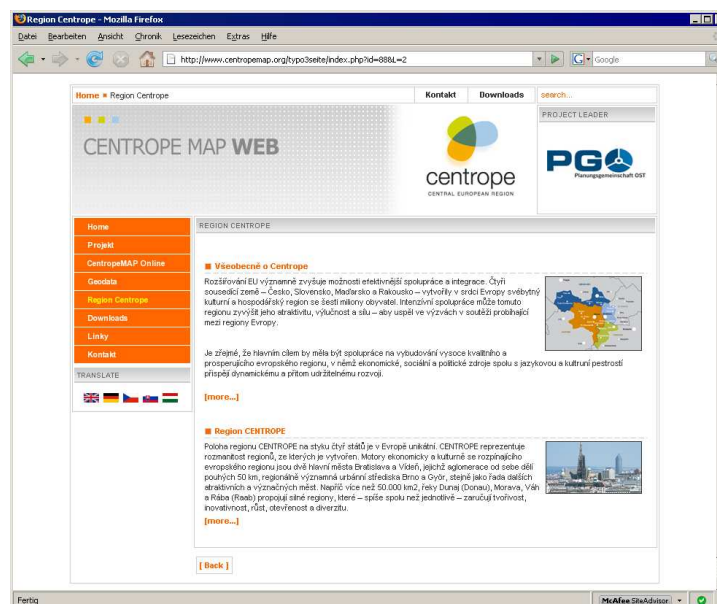
Fig. 2: The CentropeMAP website: http://www.centropemap.org/ .

In 2007, the first few thematic maps were embedded into CentropeMAP. It was only a trial how the combination of the software used and SLD technology (see chapter 4.4 also) would work together. Only a few adjustments had to be made to the Mapbender software to bring SLD layers to life, but in this release it was very hard to apply changes to the statistical data from the back-end side. So this method could not be pursued further. It is still available for the public until the new version is published but no longer kept up to date.