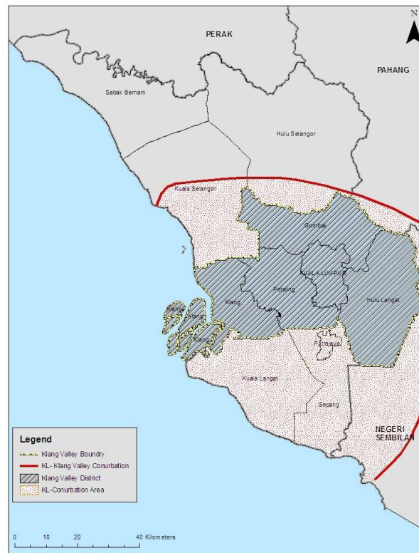
Fig. 1: Kuala Lumpur Conurbation