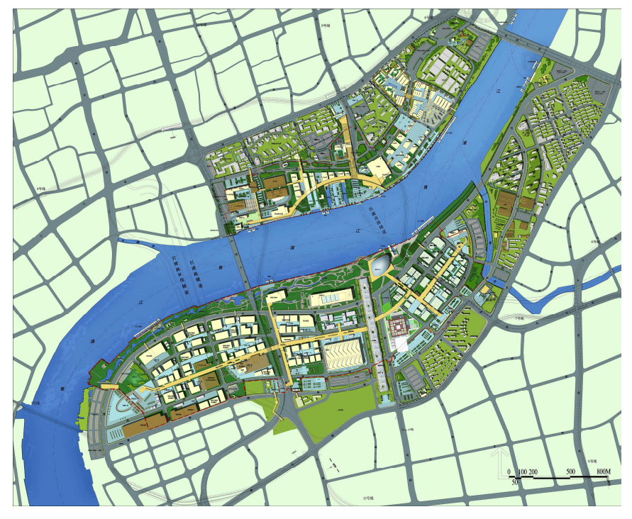
Fig. 3: The mast plan of 2010 Expo park.

and intelligent technology in order to become a model example. At the same time it provided valuable opportunities for its visitors to learn how to creat an eco-friendly building and clever solutions for smart city.