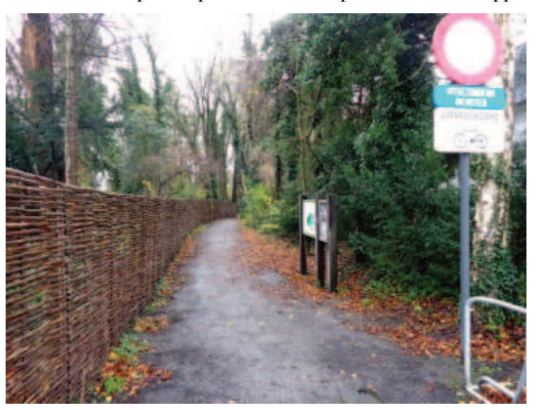
Fig. 5 entrance to the natural area Overmeers from Sint-Denijslaan

The map 6 gives an overview of the potential slow roads in the neighbourhood.