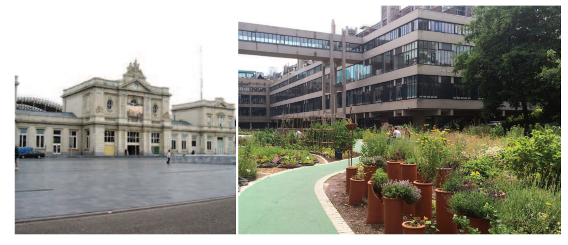
Fig. 8 Photographs of paved and less paved squares