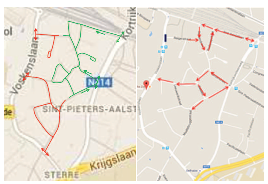
Fig. 2 original proposal traffic circulation, Fig. 3 compromise traffic circulation, end of 2015

In reality, the circulation plan led to a heavy discussion between supporters and opponents of the plan. Local inhabitants, but also a broader group of individuals (often not living in the neighbourhood), had strong opinions, resulting in news paper articles, facebook groups and facebook insults, but also in physical threats and in the burning down of one of the traffic cones during the night. Because of this, the city decided to organise the referendum much earlier, only two and a half months after the implementation of the plan. The result of the referendum was not decisive: 50% of the inhabitants favoured the new situation, 50% wanted the traffic cones to be removed, but most of them stated that there was a problem with the increased traffic in the area.