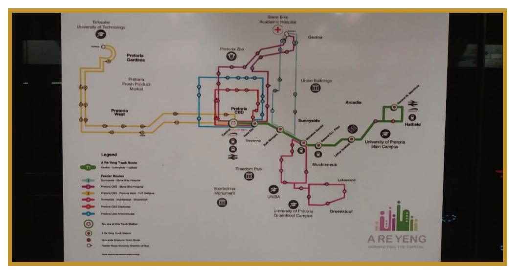
Figure 3: A re Yeng Map routes and Stations (Author's, 2018)

The above figure 3 shows the routes and stops for A re Yeng bus. There are numerous colours which represents certain routes and location serviced by A re Yeng busses. Each bus has a certain identity for example F4 is a feeder route from Sunnyside to Muckleneuk, to Groenkloof, Groenkloof is represent with a