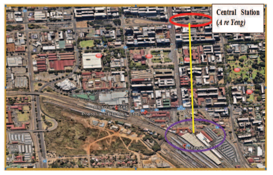
Figure 5: Spatial integration in Pretoria Station (Google earth, 2018)

In line with the above, A re Yeng bus have T1 and T2 which are Trunk routes. T1 transport commuters from Pretoria Central to Sunnyside and Hatfield, T1 service ten A re Yeng bus stations. T2 transport commuters