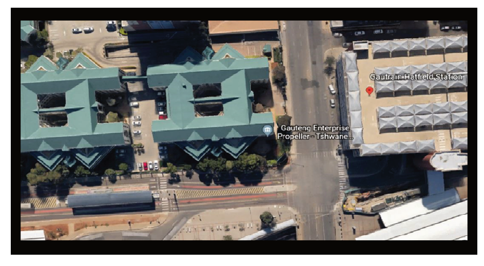
Figure 4: Spatial integration in Hatfield (Google earth, 2018)