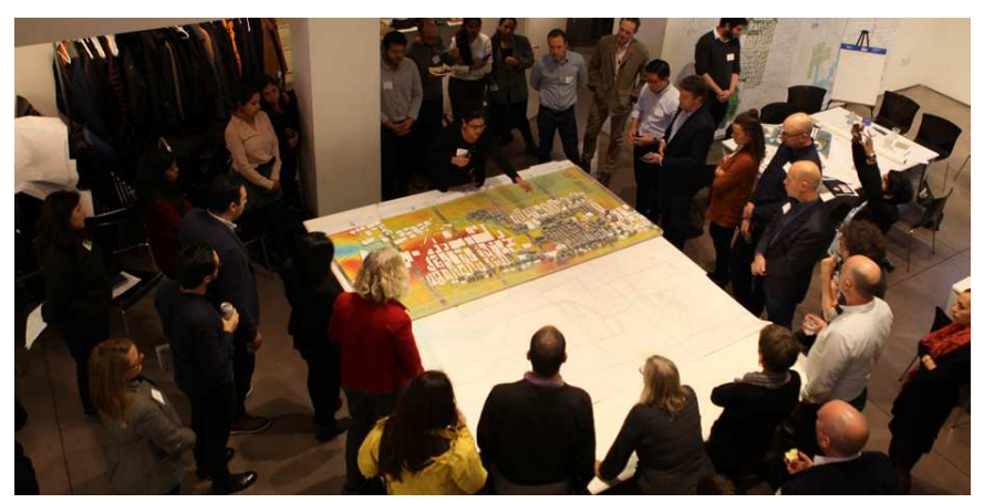
Fig.3: US and international experts at a cross-sectoral workshop held in December 2019 at the Center for Architecture in New York

An important goal of the IN-SOURCE project was the involvement of stakeholders throughout the process. This meant first and foremost identifying the relevant stakeholders in each case study region, for example, administration/municipality representatives, urban planners, energy and water utilities, food producers and logistics companies, supermarket associations, food promoters, citizens and NGOs. A stakeholder mapping table was produced in order to get an overview. In addition, potential contact persons were evaluated in terms of their professional affiliation with the respective nexus elements and their possible influence on the project.