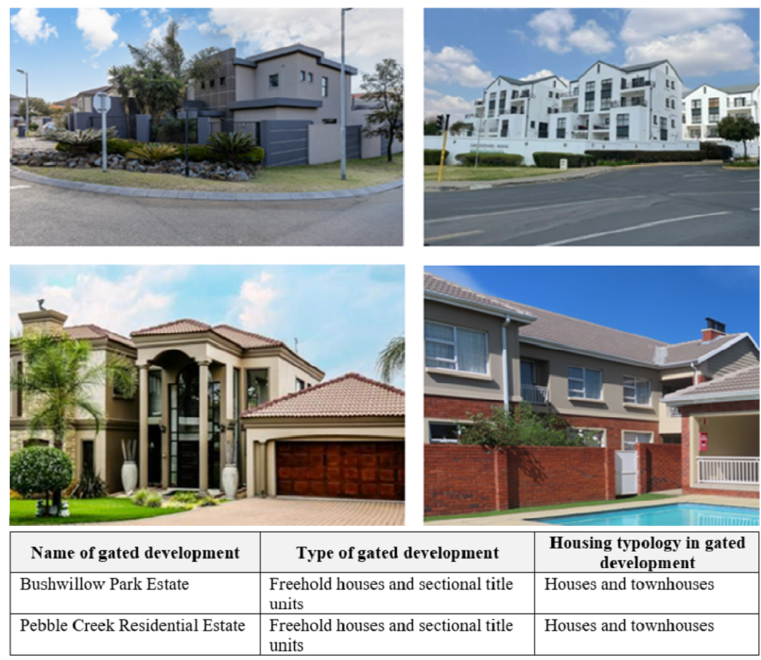
Fig. 3: Housing typology in Pebble Creek Estate and Bushwillow Park Estate, Johannesburg

complexes, shopping malls, townhouse complexes and gated residential communities with free-standing houses.